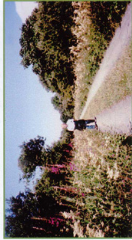
Above : a wonderful display of meadowsweet in the Curragh lanes.